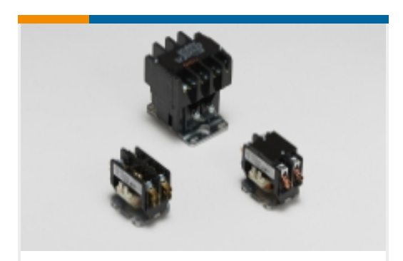
Definite Purpose Contactors(1)