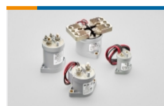
General Purpose Contactors(4)